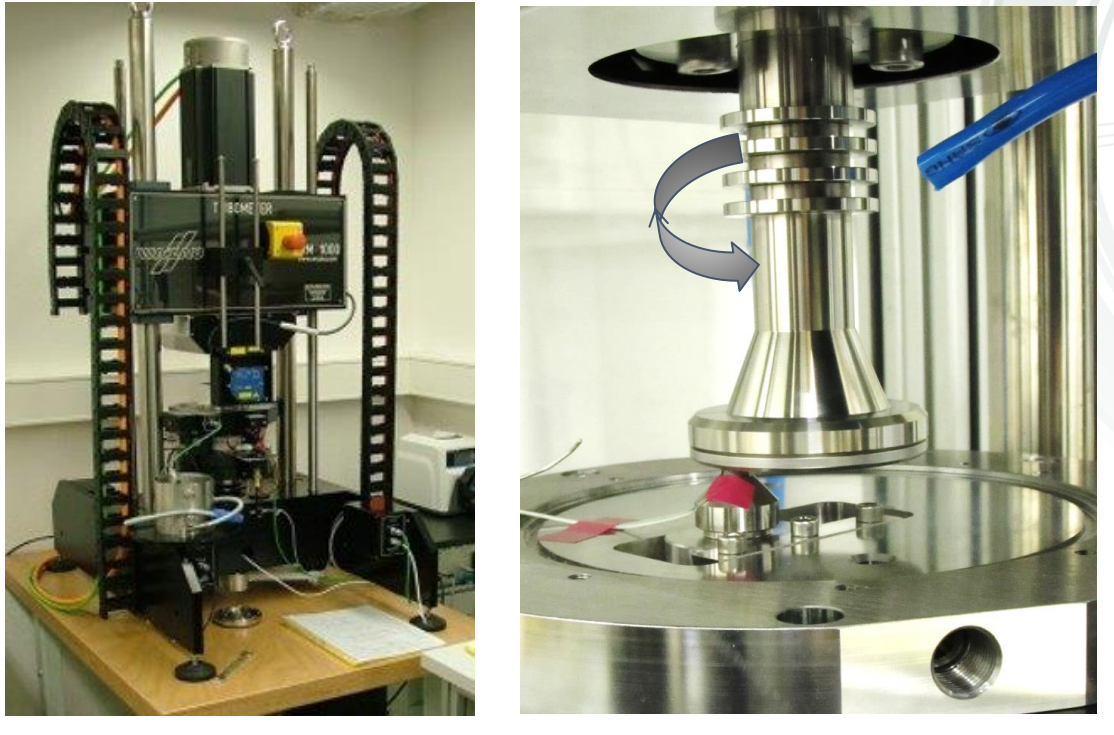
Figure 3: Tribological test rig (TRM 1000, Wazau, Germany) and test setup.

The test conditions of this test series are given in Table 2.